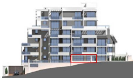
side elevation - red square indicates this apartment